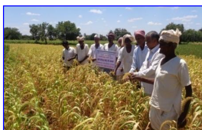
DEMONSTRATION OF FOXTAIL MILLET CROP

Impact : KVK interventions have resulted in spread of Millet area under improved varieties in 1500 hectares. About 30 Millet Growers have become entrepreneurs and are supplying processed millet grains to consumers. Millet Cafeteria established at KVK Campus attracts 100-150 people daily and created lot of awareness on Millet Nutrition. The Millet Sale Counter has a transaction of Rs.4.50 lakhs per year.