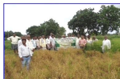
DEMONSTRATION OF LITTLE MILLET CROP