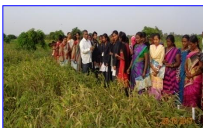
DEMONSTRATION OF BROWNTOP MILLET CROP