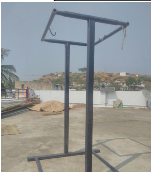
Gunny bag holder stand (innovation)