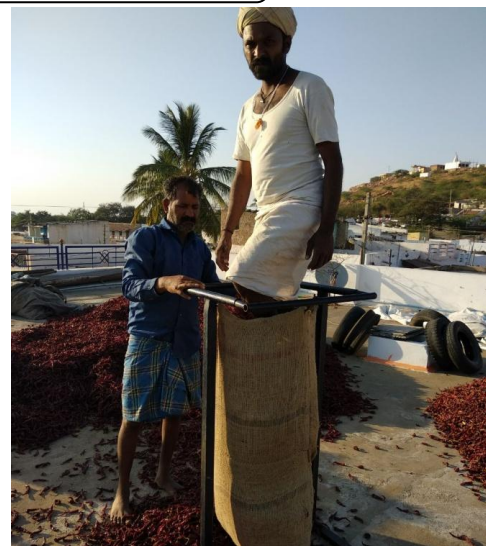
Packing of Chilli pods with the help of innovative equipment