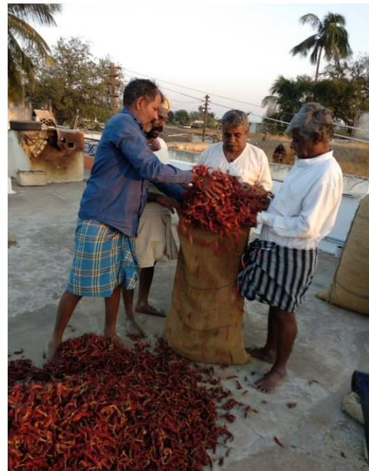
Traditional method of packing