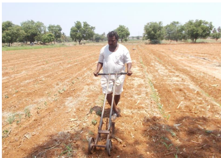
Usage of Intercultivation cum weeder equipment in the field