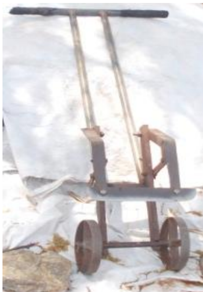
A close view of Intercultivation cum weeder equipment